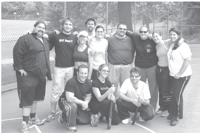
Chapter Icaros Wiffle Ball and Soccer Tournament May 15, 2004. Teams were Brookline vs. Verona. In a very close wiffle ball game, Verona won 17-16. Afterwards in the soccer game, Brookline beat Verona to even the score.