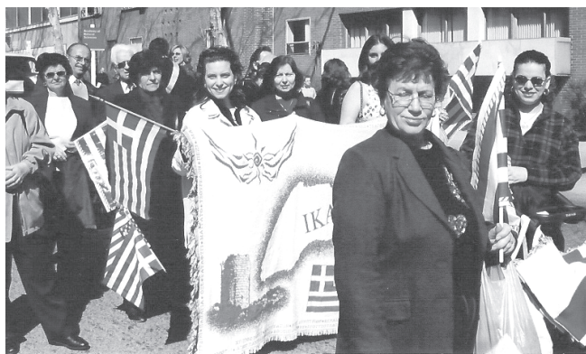
Atheras Chapter members enjoy a great day.