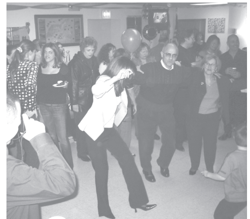
Foutrides Leski Party