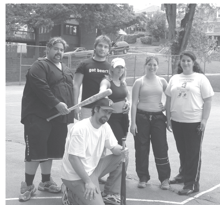
Chapter Icaros Wiffle Ball and Soccer Tournament Brookline Team