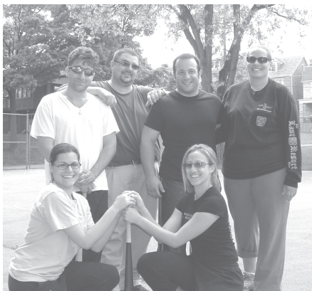
Chapter Icaros Wiffle Ball and Soccer Tournament Verona Team