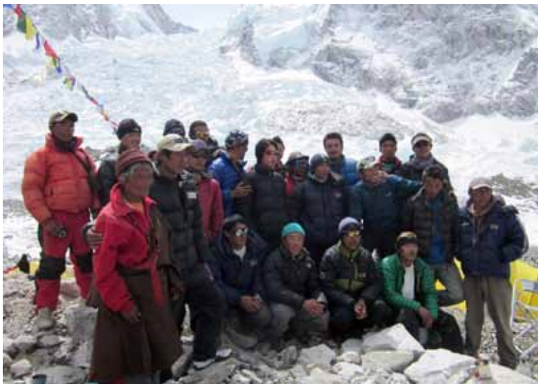
Sherpa support team