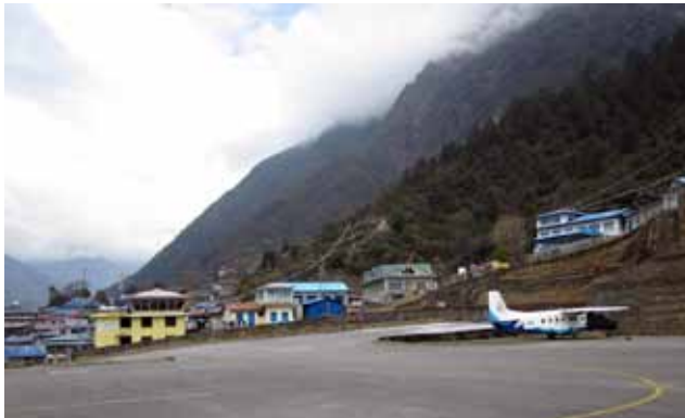
(left) Lukla air landing strip; no motorized vehicles beyond here (right) Hiking up Khumbu Valley from Lukla airport on the way to Everest base camp