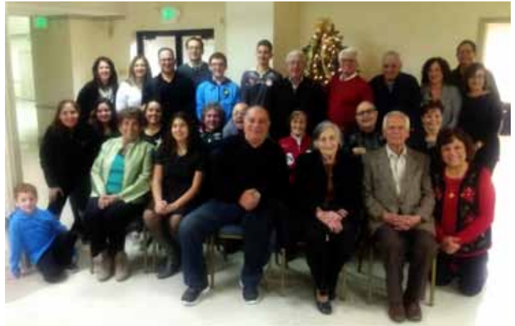
Chapter Christmas Party 2015