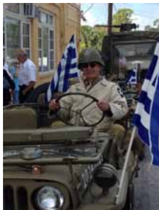
Helios Chapter members participated in the Greek Independence Day Parade in Tarpon Springs, FL on March 20, 2016. We all had a great time!