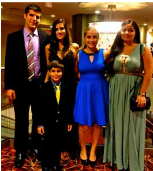
Lefkas chapter members