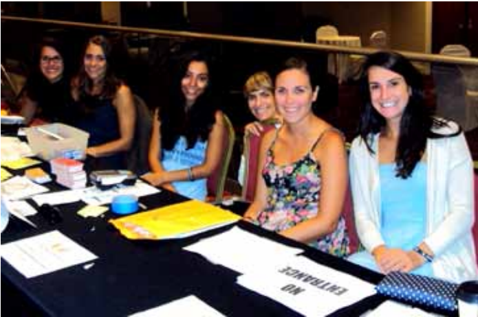
Left: Volunteers at Event Sales table