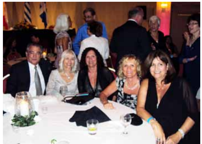
Glaros family members