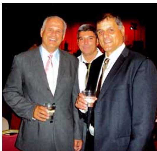
Proudly representing Cleveland