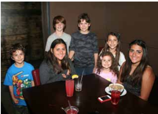
Another successful event in the history books!